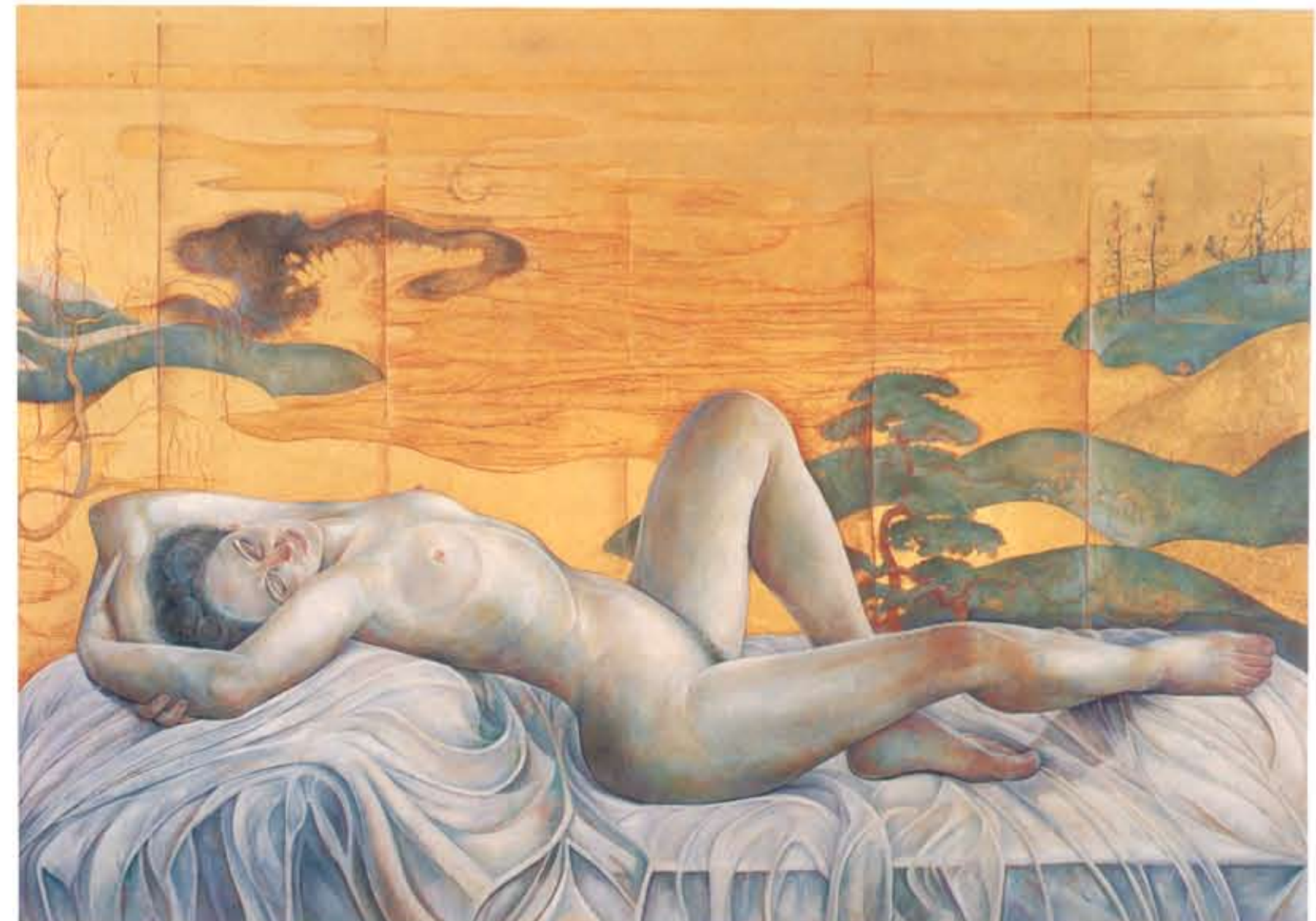
Passage of the Moon , oil and gold leaf on wood panel, 47.5" x 67.5", 1998.