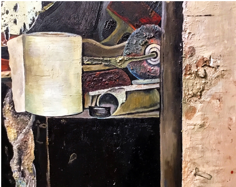
Simon Dinnerstein. Detail of The Sink .

We see the build up of certain types of marks – some in service of the illusion, some in service of the design. In a sense the aim here is to be more real than real. How? By going beyond the depiction of the plasticity of the form and suggesting to us what our hand would feel if we were to touch it. That haptic aspect is huge in Dinnerstein's work. There is an experiential shift happening. It is not merely about passively receiving. The mirror neurons in our brains fire in recognition. The artist's incisive and insightful observation translates something more than what is seen. We get the feeling of seeing