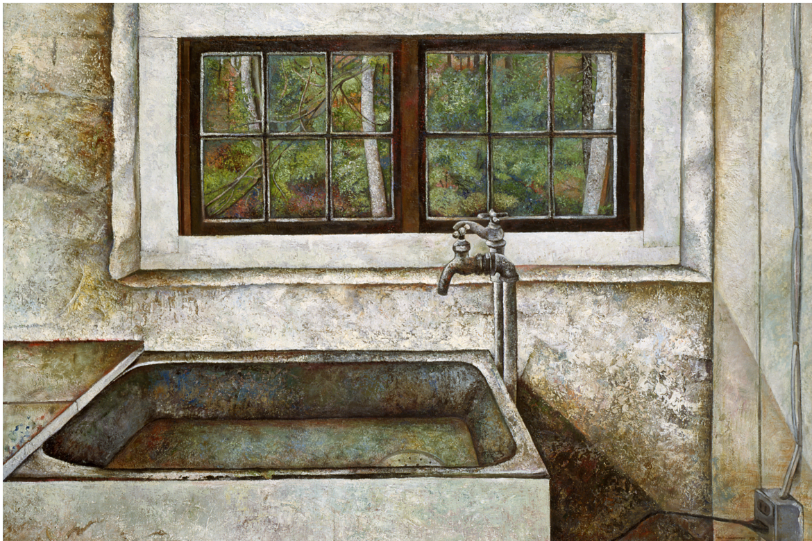
Simon Dinnerstein. Alexander Studio , Oil on wood panel. 1979.

That is, they suggest that the gaze of an individual can catalyze into transcendent, meaningful vision, crafting an image that is more than the sum of its parts. It can be more iconographic and designed – such as Giotto, van Eyck, or Pontormo – or it can be more perceptual – like Giorgione, Ribera, or Freud. I see Dinnerstein and Garcia bridging the distance between these two groups. Garcia defaults to observation, Dinnerstein to design, yet both operate with powerful meaning-making attention. Whether to observe or design, the strenuousness underlying the work is palpable.