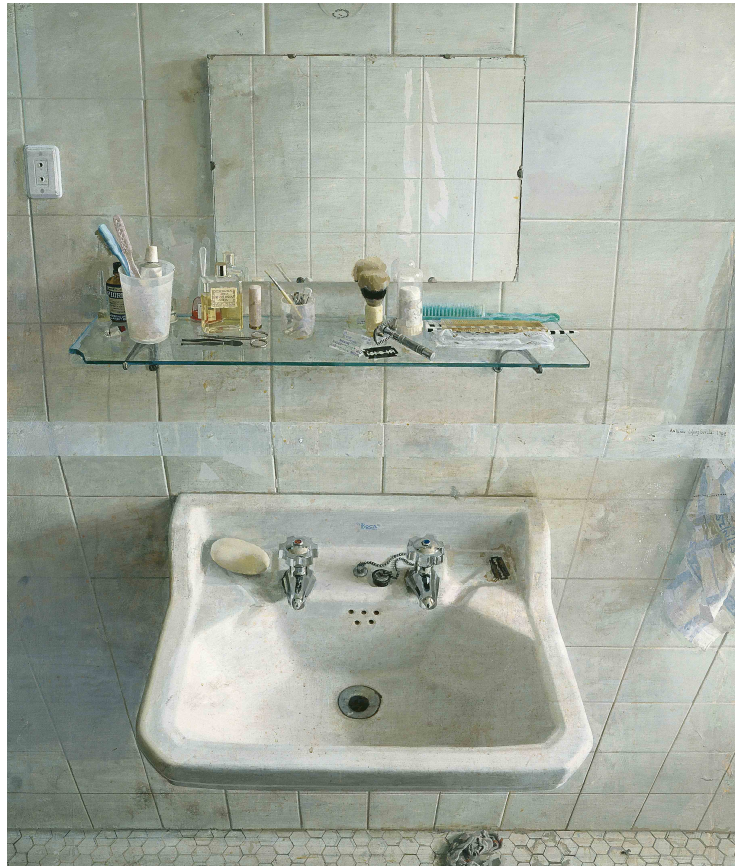
Antonio Lopez Garcia. Sink and Mirror , Oil on wood. 1967.