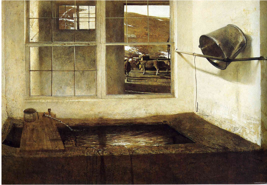
Andrew Wyeth. Spring Fed , Tempera on panel. 1967.

attention within their work its full due. Instead, I want to look at a cross section of just a few works that demonstrate the evocative affinities these two artists share. Let us consider sinks and windows.