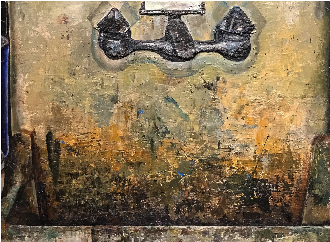
Simon Dinnerstein. Detail of The Sink .

fiction done in order to “make the unstable world stable.” 6 Garcia and Dinnerstein have both engaged in this stabilizing action through their attention, but they also undertake what Werner Herzog calls “the ecstatic truth.” 7 That is, they go beyond simple reportage, beyond documentation, and present a fiction that is, in a sense, truer than true.